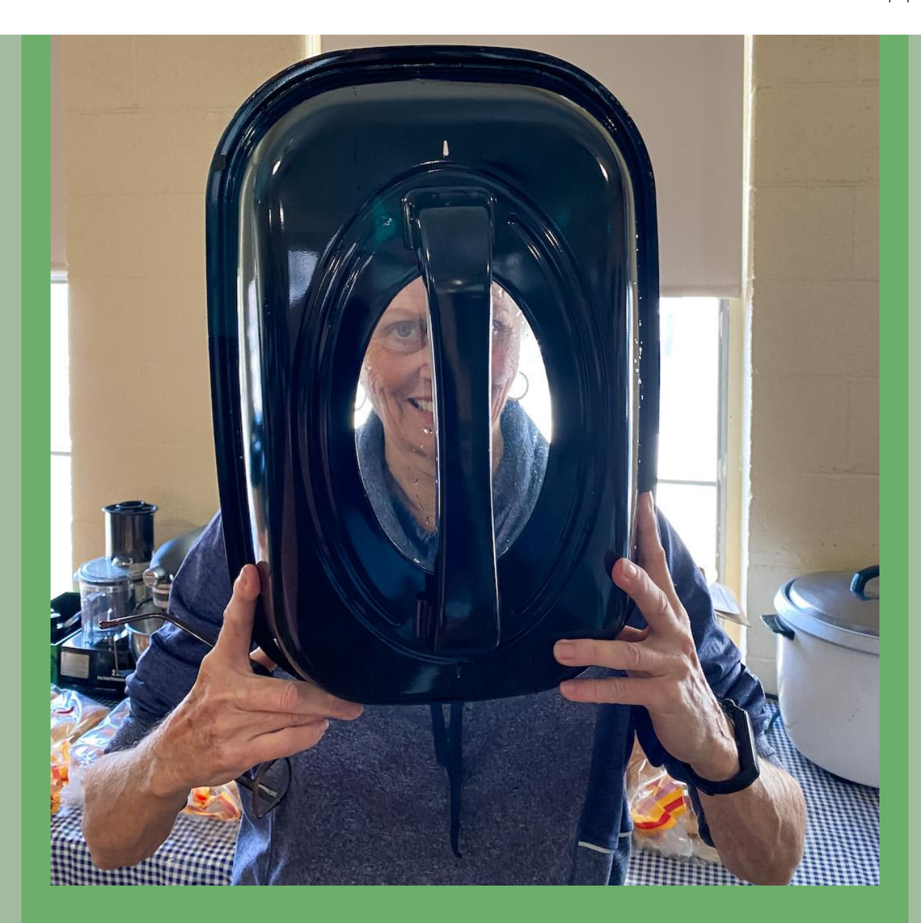
The Biggest Turkey of All!